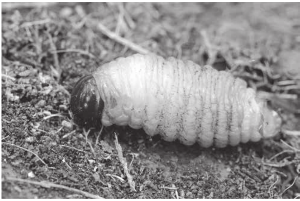
Magnification \times 10

The photograph below shows a larva of R. ferrugineus .